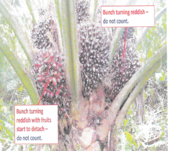
The Black Bunches Census must be count