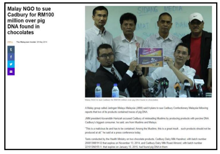
Picture2: Lawsuit against Cadbury by NGOs for RM100 Million

among the public continued to escalate on Facebook and other social media platforms. Some called for a nationwide boycott of Cadbury's products, demanding all its factories to cease operation. Others even insisted that the products be thrown away and wanted Cadbury to take up responsibility and cleanse the tainted blood in their veins. Several non-governmental organizations (NGOs) were contemplating to launch a joint lawsuit against Cadbury for RM100 million (see Picture 2).