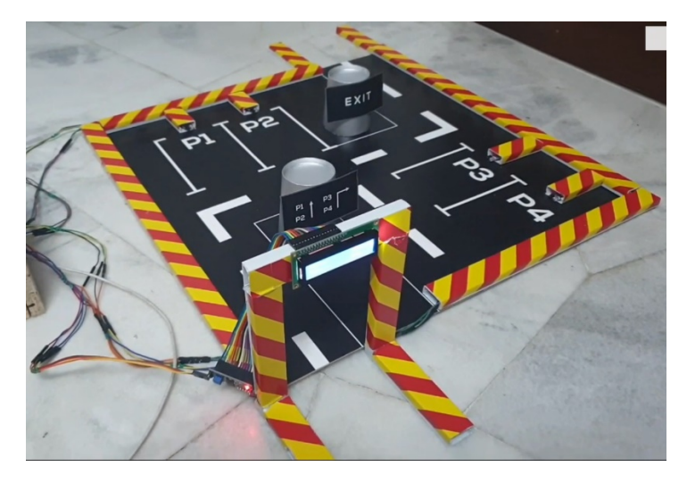
Figure 2: Prototype of IoT based Car Parking Management System using IR Sensor

The main objective is to design and develop a car parking system using the IR sensor technology to detect the vehicle. The process involved designing the car parking system with IR sensor. This IR sensor is used to detect vehicle when it enters a vacant parking space. Besides, this proposed system also used the LCD display screen to display the vacancy of a parking slot. All data collected will be stored in the database and can be accessed through the interface provided by the car parking management system. The aim of the proposed parking system is to ensure that the structured information application given is able to function and operate well. Therefore, the prototype of car parking system was designed and integrated with the car parking management system in a small scale to be tested to the users. Figure 2 shows the prototype of the proposed car parking management system using IR sensor.