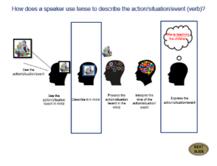
Figure 2: Introduction lesson on 'viewing frames'

Grounded on the conceptual framework that consolidates the cognitive grammar model (Radden and Dirven 2007) and Vygotky's STI-mediation theory (Systemic Theoretical Instruction-mediation) (1978),GLOw@CBI offers learners a different experience of grammar learning through its' grammar lessons and exercises on tenses that are not only easy for students to understand, but which are also meaningfully presented (Haliza et al 2017).