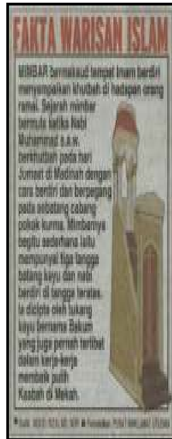
Figure 2: Prophet Muhammad mosque minbar design