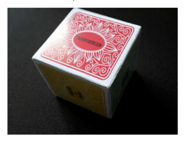
Figure 3: The Dice