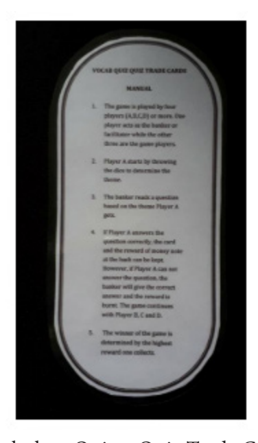
Figure 2: The Vocabulary Quiz – Quiz Trade Cards Manual