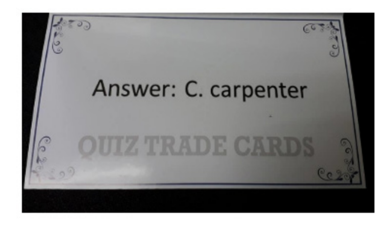
Figure 5: The Answer (flip side)