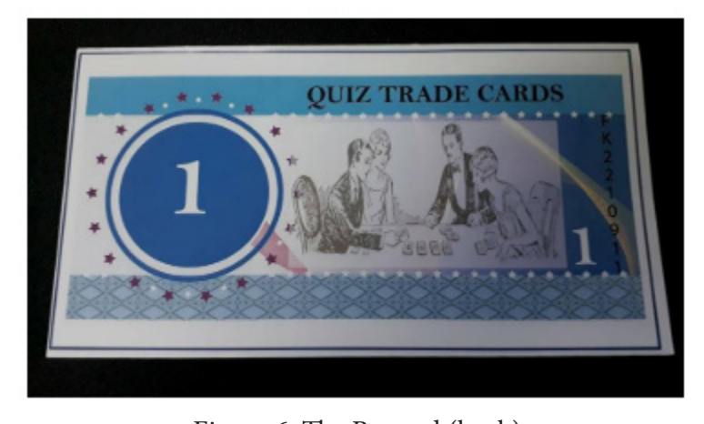
Figure 6: The Reward (back)