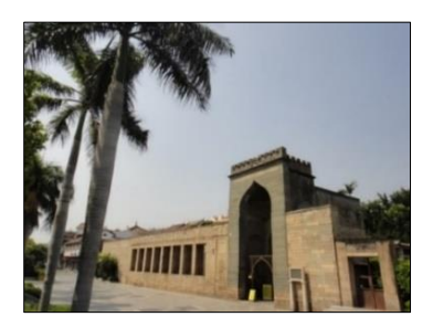
Figure 5 illustrates the entrance of Qingjing Mosque which portrayed an Arabian architectural style; with a rectangular-shaped design with pointed-arch of front entrances (Frishman et.al., 2002).