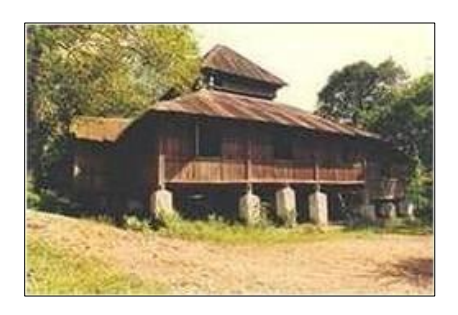
Figure 7 shows an example of a traditional vernacular mosque in Malaysia.