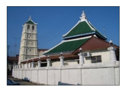
Figure 8 indicates the sino-eclectic style mosque in Malaysia.