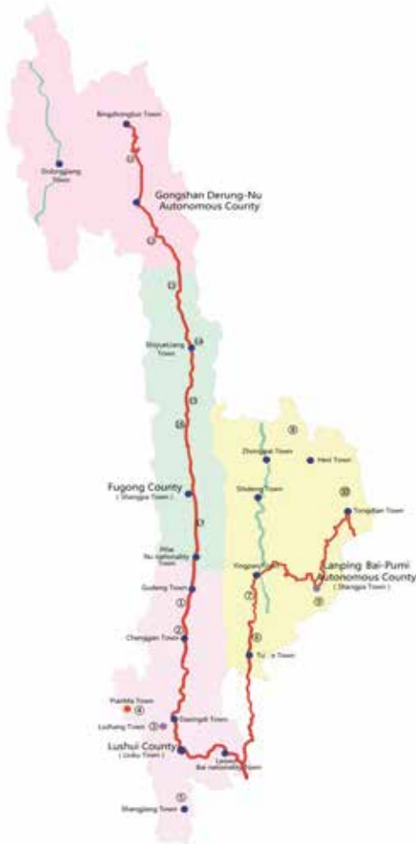
Figure 1: Location Distribution Map of Survey Villages in Nujiang

In Lanping County: No. 6-7 Lamadeng village of Tu'e Town, No.8 Lagu village of Yingpan Town, No.9-10 Renxing village of Hexi Town, No.11 Guanping village of Jinding. No.12 Xiadian village of Tongdian Town. In Gongshan County: No.13, Shandang village of Pengdang Town, No.14, Qida village of Puladi Town. In Fugong County: No. 15-16, Mujiajia village of Maji Town, No.17-18, Lishadi village of Shiyueliang Town, No. 19-20, Majiadi village of lumadeng Town, No.21, Chihengdi village of Lumadeng Town, and No.22-23, Pubai village of Zilijia Town.