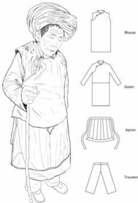
Figure 3: Lanping Type Portraits and Pattern of Lisu costumes

Samples No. 7-12 belong to the second costume type. The costume features are as follows: wearing black headcloth or black/blue Service hat; wearing a blue Blouse inside the upper body, with the right opening of top fly, no sleeves and stand collar, Hem length to knee in front and back. The outer side of the Blouse is a black or blue gown with stand collar and long sleeves, right opening of top fly, Hem short in front and long in back, length front to waist, back to knee. The lower part of the body is wearing black trousers with cotton fabric; and covered with a black cotton apron outside. Since most samples from No. 7-12 are from Lanping County, they are called as "Lanping type of Lisu costumes" (Figure 3).