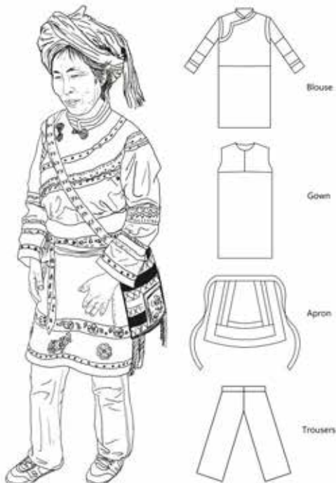
Figure 2: Lushui type portraits and pattern of Lisu costumes

Samples No. 1-6 belong to the first costume type. The costume features are as follows: wearing black headcloth or round hat; wearing a blue Blouse inside the upper body, with the right opening of top fly, long sleeves and stand collar, Hem short in front and long in back, Length front to waist, back to knee. The outer side of the Blouse is a white flax gown with no collar and sleeves, Middle Opening of top fly, Hem short in front and long in back, Length front to chest, back to leg or lower more. The lower part of the body is wearing black trousers with cotton fabric; and covered with a black apron outside. Since most samples from No.1-6 are from Lushui County, they are called as "Lushui-type of Lisu costumes" (Figure 2).