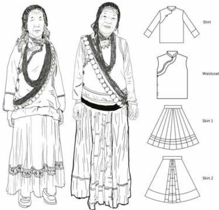
Figure 4: Fugong Type Portraits and Pattern of Lisu costumes

characteristics of the second style are: The upper part of the body is wearing a velvet Waist, with the right opening of top fly, Stand Collar and no sleeves; the lower part is a long black velvet skirt, long sleeveless and small collar; the lower body is wearing a black velvet long skirt. Most of the samples from No. 13-23 belong to Fugong County and its northern areas. Although the samples from No. 13-14 belong to the Gongshan County, nevertheless, there are frequent exchanges between the local and Fugong area, so we generally call them ‘Fugong type of Lisu costumes’ (Figure 4).