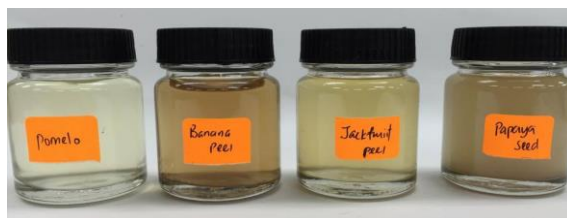
Figure 1: Bioflocculant extracts from pomelo peels, banana peels, jackfruit peels and papaya seeds (left to right)

Different types of solvent such as water, organic solvents and salt solutions had been used to extract bioflocculants conventionally. Success in extracting seed-based flocculants using salt solution had been reported in the literature by numerous researchers [14, 15]. In fact, Zurina et al. [16] reported that better turbidity removal could be achieved by using salt solution as the extraction solvent for Jatropha seed flocculant. According to Zurina et al. [7] and Lee et al. [8], water is by far the most popular choice due to its good polarity, abundance and is available at no cost. In this preliminary study, distilled water was selected as the solvent in the preparation of bioflocculant extract from different fruit wastes. Figure 1 shows the extracts from banana peels, jackfruit peels, pomelo peels and papaya seeds, respectively. Bioflocculant extracts with different colour were obtained, probably due to the presence of different colour pigments in different fruit wastes used. Among all, banana peel and papaya seed extracts appeared in darker colour intensity in contrast to jackfruit peels and pomelo peels. In addition, pH of the extracts was also differed in the range of 4.98 – 6.25. This could be contributed by different amount of anthocyanins (a group of naturally occurring phenolic compounds) present in the fruit wastes, which played important role in colour quality and pH of the fruits [17].