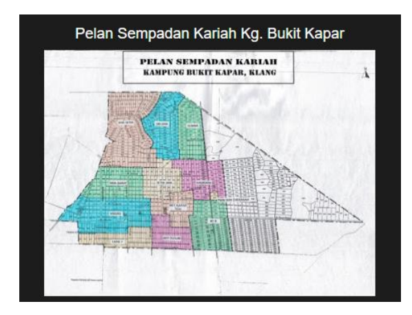
Figure 2 The original image

In the first step, a two-dimensional image was obtained from the website infobukitkapar.blogspot.com with the title of 'Pelan Sempadan Kariah Kampung Bukit Kapar, Klang, Selangor'. The original image is shown in Figure 2.