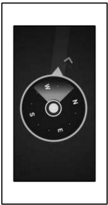
User interface for Qibla compass