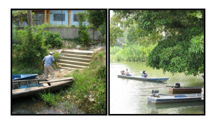
FIGURE 3 Transportation Methods of Local Community in KampungBeng

Circulation networks are system for transporting people, goods, and raw materials from one to another. Range from trails and footpaths to roads, canals, highways and even airstrips. KampungBeng in Lenggong was significance by remaining with using sampan as their daily transportation even though there is a road to that village. It became their nature of living.