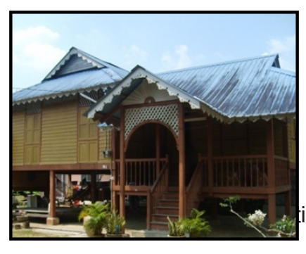
FIGURE 2 Traditional Houses of Lenggong