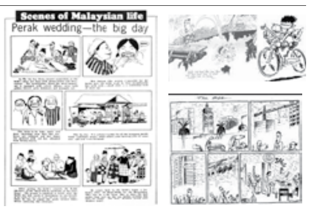
Picture 1: 'Scenes of Malaysian Life' by Lat

greater, not only due to their desire to produce funny artwork, but also to keep up with new media and technological developments. Cartoonists then became more progressive and hence started to find different approaches and styles to attract cartoon lovers (Muliyadi, 2010, 2016).