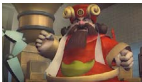
Picture 6: Nien Resurection and Skyland Animation

Filem Negara Malaysia (FINAS) kept producing short animated movies with moral values while still utilizing 2D techniques. Examples of such movies were 'Bangau oh Bangau' (2001), 'Telur Sebiji Riuh Sekampung' (2003), 'Anak Rusa Nani' (2004) and 'Pancaroba' (2005). In 2005, TGVC produced an animated series titled 'The Journey Home' (FINAS 2015). The 13-episode animated series 'Saladin' published by Silver Ant and Young Jump Animation in 2005 was a local 3D animation of high quality. The series won the Best Technology category at The Seoul International Cartoon & Animation Festival (SICAF); and the Tokyo Big Sight Award for the 3D CGI, Special Visual Effects and Animation category at The International Anime Fair 2007 (FINAS 2015). In 2006, 2 animations were released, which were 'John and Lucy' by Makmur Megah's Animation and 'Duwi' by Quest Animation. These were followed by 'Ranggi', which was a unique animated series that had been made with clay and had thus been called clay animation. This technique, which was introduced by Will Vinton, was quite outdated and was also known as 'claymation'. (Hassan Muthalib 2016).