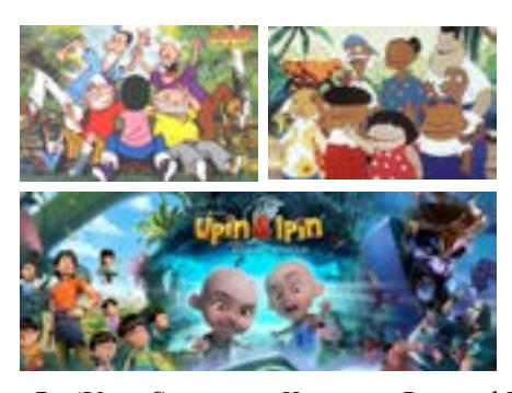
Picture 7: 'Usop Sontorian, Kampung Boy and Upin dan Ipin'

From 1978 until 2016, the Malaysian animation industry has produced about 132 animations including animated series, short movies and movies which involved 68 publications. Furthermore, animated series like 'Kampung Boy' by Datuk Lat achieved about 6 awards, which were the Eisenhower Fellowship (1998), the Asian Fukuoka Cultural Awards (2002) and many more. The same goes to 'Saladin' that won the Best Technology category in The Seoul International Cartoon & Animation Festival (SICAF) and the Tokyo Big Sight Award at The International Anime Fair 2007 for the category of 3D CGI, Special Visual Effects and Animation. 'Boboiboy' reaching RM19 million in 2016 was the proudest moment for our local animation industry, as it was the first time they had hit such a number whilst competing with other blockbuster movies. Despite the major hurdles in front of them, they had succeeded.