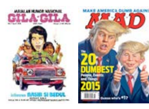
Picture 2: 'Gila-Gila' Magazine and Mad Magazine

Referring to the Malay Magazine directory for the 20th century, Hamedi (2005) observed that since their first appearance in the 1970s to the 1980s, cartoon magazines or comics had increased their number of publications from 15 to 25 copies. Studies also showed that humour magazine Gila-Gila was ranked 3rd after the magazines 'Wanita' and 'Utusan Radio and TV'. About 79 local magazines and 31 foreign magazines were listed on the report, and this report indirectly showed that humour magazines were relevant enough to be published for market purposes (Hamedi, 2008).