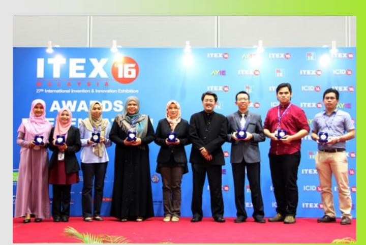
A WeCWI project entitled "Innovate Teaching toward Personalised Learning through WeCWI Integrated Solutions" was awarded a silver award in the 27th International Invention & Innovation Exhibition (ITEX) during 12-14 May 2016 at Kuala Lumpur Convention Centre, Kuala Lumpur, Malaysia