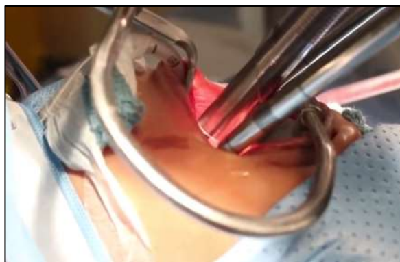
Figure 2 Close-up view of the positioning of ETT with robotic arms in place