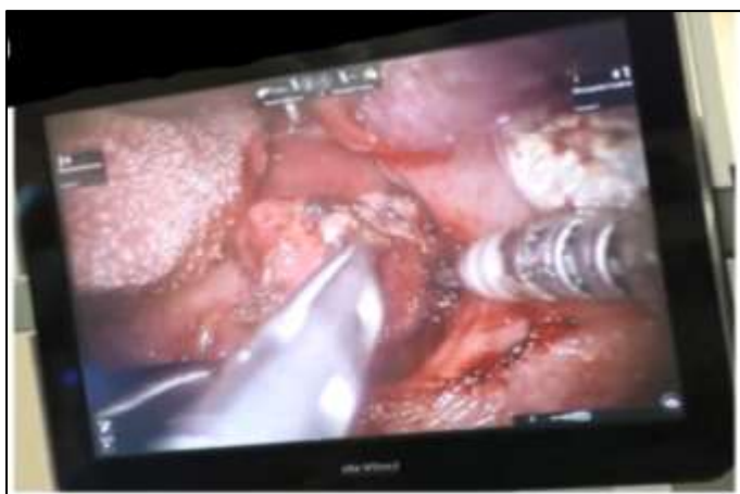
Figure 4 Three-dimensional endoscopic view with magnification of key structures produced by TORS. The clean dissection plane of tonsillectomy can be seen.