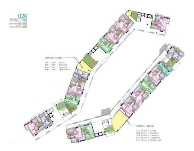
Figure 1: Proposed Layout Plan.

The collective living strategies through environmental, socio-cultural and spatial approaches discussed earlier in the Methodology section are applied in this design proposal. The public spaces within the housing block are every bit as important as the habitable spaces. The public spaces are the communal spaces or "space collective" which is designed to be at every floor and is intended for community cohesion. The floors are vertically and horizontally connected. On various levels there are programmatic spaces intended to provide residents with the necessary facilities for eventful collective living such as religious centres, eateries, nursery and gymnasium which are all connected by "vertical gardens" accessible via staircases and lifts.