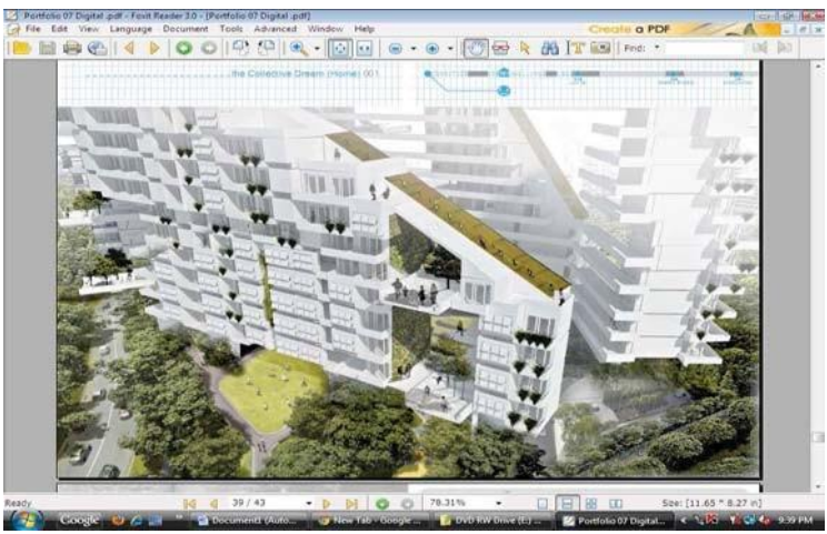
Figure 4: Perspective View of the Design Proposal (Source: Muhamad Shamin, 2012).