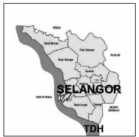
Figure 1: Taman Dato' Harun (TDH) in Petaling Jaya

There is a periphery of fences surrounding the five blocks of flats which give the housing area a sense of security. Inside the housing area, there are car parking spaces, a mosque, a playing court, one community hall, one meeting venue and green open spaces (Figure 2).