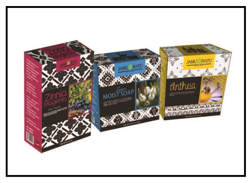
Figure 2 Proposed packaging design for Jamu Ratu Toiletries

Figure 2 is the proposed packaging design without interfering with the product's original concept idea – modern and contemporary. The researchers inserted the culture value to give the feeling of the origin of the product. The culture value can also be seen on the consistent pattern implementation on each of the packaging design.