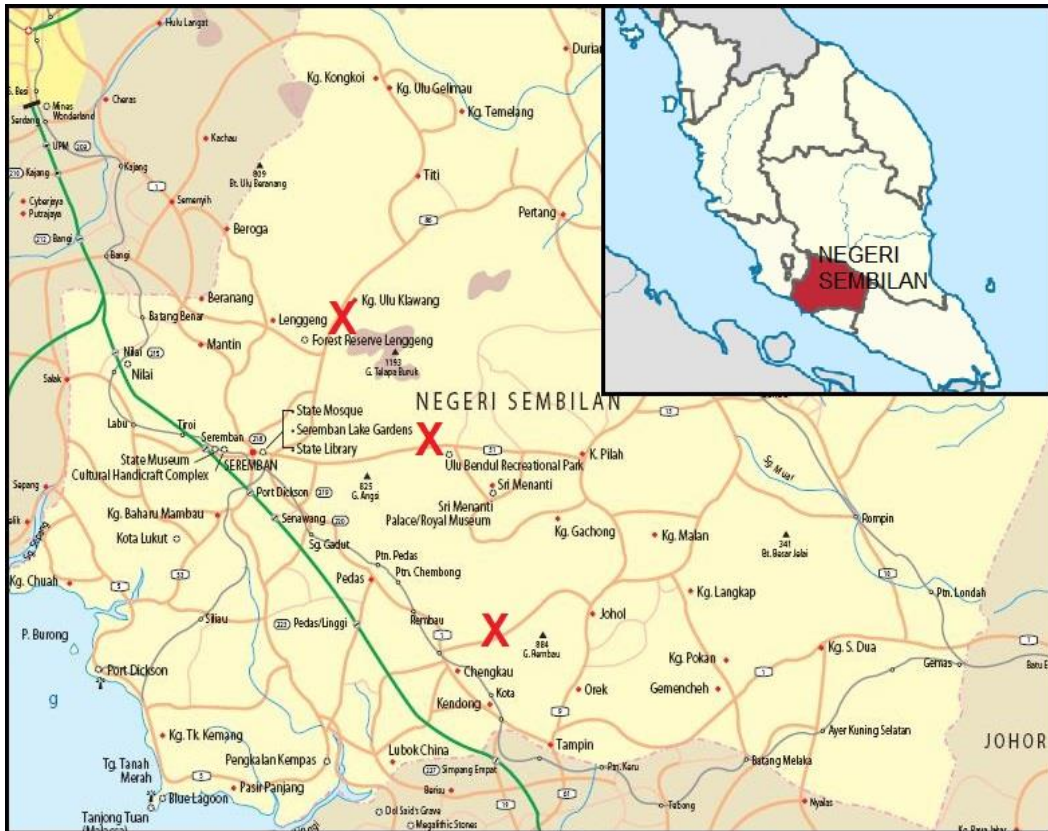
Figure 1. Three sampling locations in Negeri Sembilan