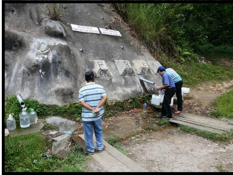
Figure 3. Collecting NSW samples at Kaki Gunung Angsi