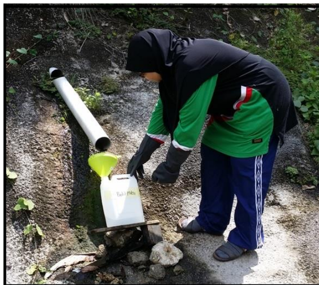
Figure 2. Collecting NSW samples at Bukit Miku

Each NSW sample was carefully collected using a two litre High Density Polyethylene (HDPE) bottles which are labelled with dates and location of samples taken. As a precaution, a pair of clean rubber glove was used to avoid cross contamination and all HDPE bottles were rinsed with dedicated NSW twice before filling process have been made. Samples were transferred to the UNIPEQ Sdn. Bhd laboratory for heavy metal analysis.