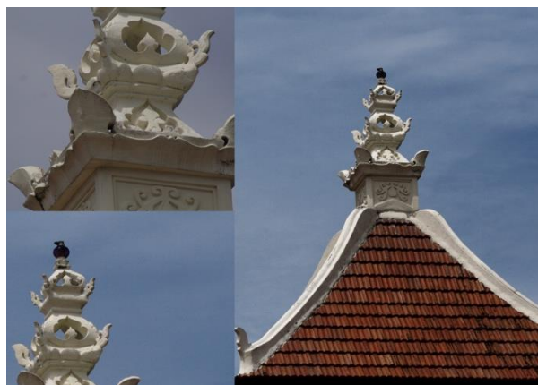
Plate 1: Roof crown of Masjid Peringggit

Islam has already arrive in Malay-Archipelago since 7th century and started with Western Sumatra, Indonesia by the traders. Malay-Archipelago is a group of island located between South East Asia and Australia including Malaysia, Indonesia and Philippines. Historically, Malay-Archipelago ia a region with full of natural resource ao it become one the most important traders route in the world at that time. Pyramidal roof become an icon of architectural style in Malay-Archipelago. In 15th century, there are many mosques build by the community especially Muslim traders who came to Melaka. The emergence of mixed art happened during colonial conquest period.