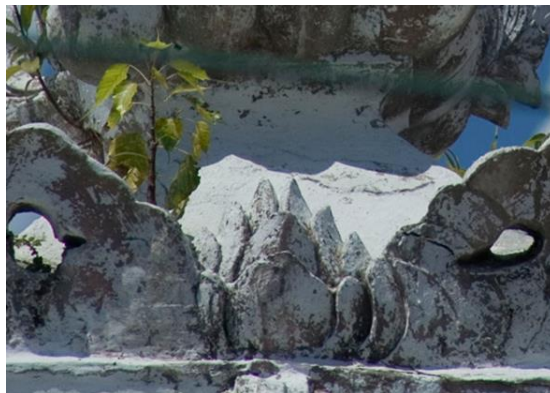
Plate 3: Lotus motif on Masjid Tengkerah

The uniqueness of most Melaka traditional mosques compare to other state mosque in Malaysia is the roof crown were shaped as a lotus flower motif (Nelumbo Nucifera). According to Abdullah Mohamed (1978) cited by N. Utaberta (2012), in his discussion on the domes of mosques in Melaka, where he reiterated that the dome is originally thought of as a flower bud, that is later adapted and shaped into various permutations. Titus Burckhardt (2009) stated that the lotus as the image of soul opening up to the transcendent light. In traditional Melaka mosque design, roof crown is one of the most important symbolic elements.