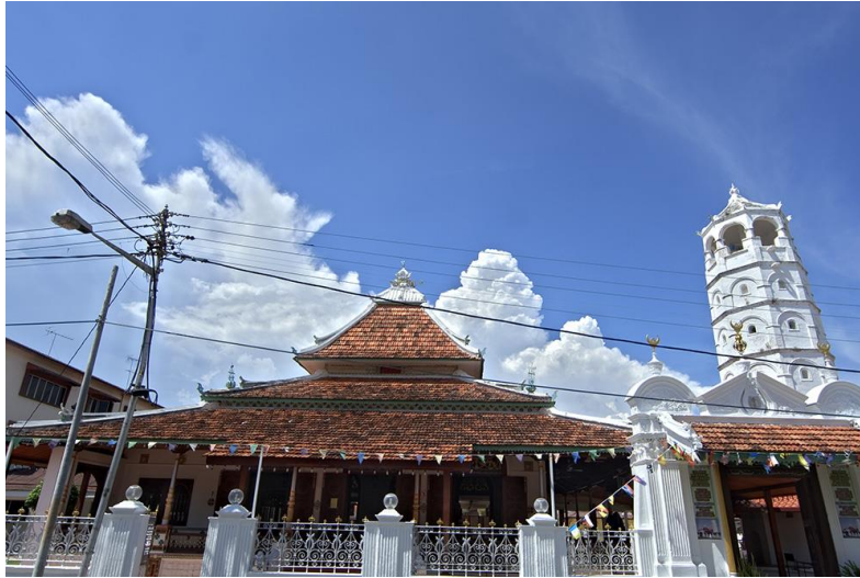
Plate 2: Masjid Tengkerah

Masjid Tengkerah also known as Tranquerah Mosques were built in 1728 was one of the directly Chinese influences on the architecture itself. With the minaret similar with the pagodas in China.