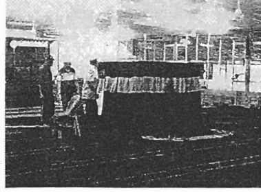
Figure 1.1: Site observation during lecture and practical session