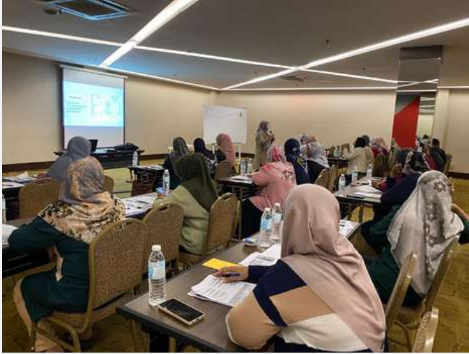
Event in Pulau Pinang