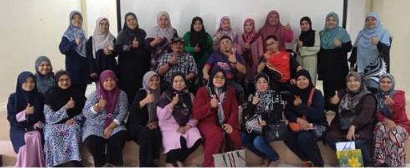
Event in Melaka