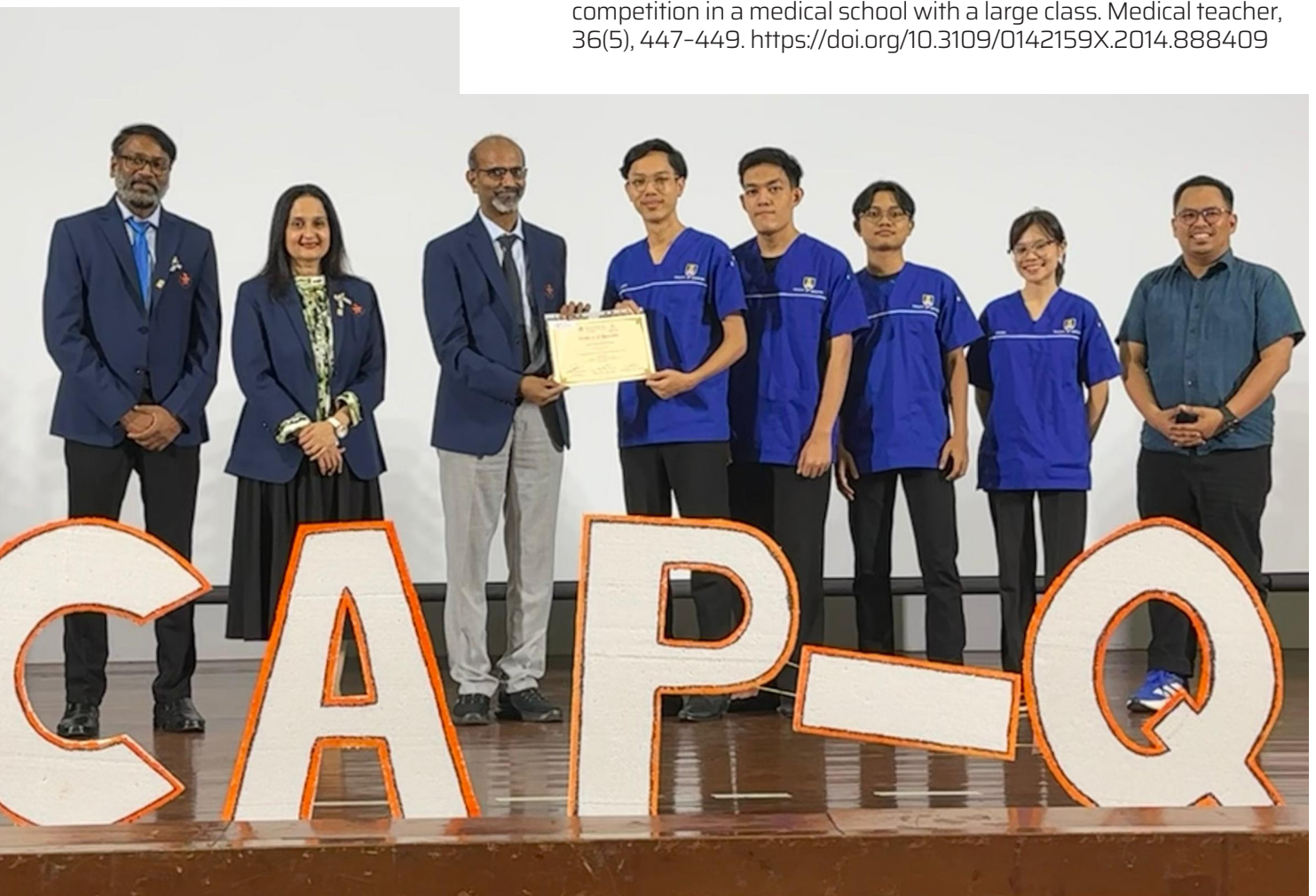
UiTM team receiving a certificate during the award giving ceremony.