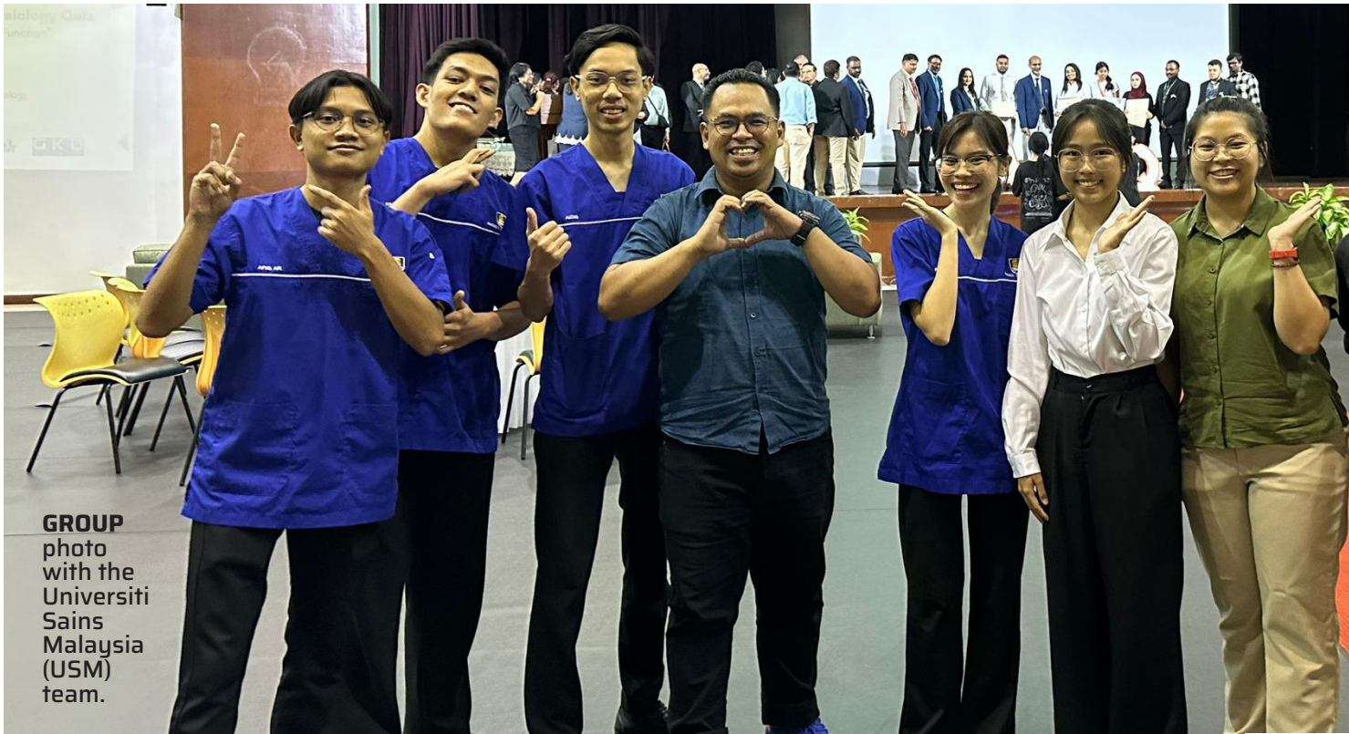
GROUP photo with the Universiti Sains Malaysia (USM) team.

for developing scientific literacy and professional competitiveness 1 .