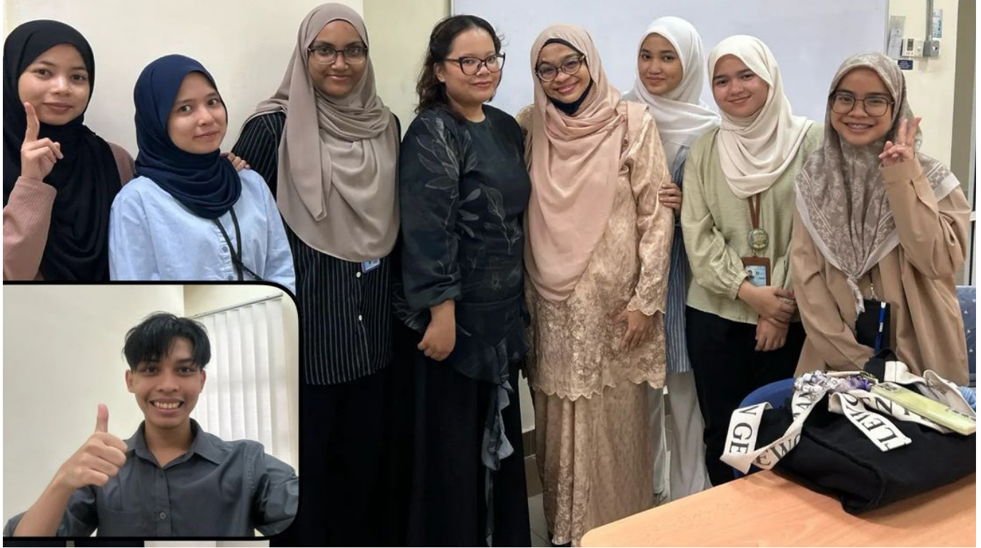
UNIVRAB student together with UiTM medical students during academic session at the Faculty of Medicine, UiTM.