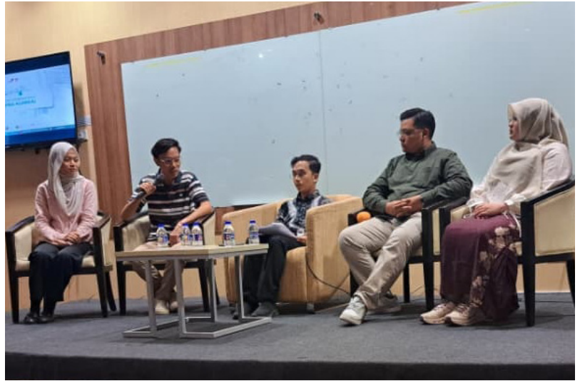
UiTM-UNIVRAB student sharing session featuring discussions on pre-clinical and clinical studies and student life.

In addition to academic exposure, the programme included enrichment activities such as an academic building tour, an Institute of Medical Molecular Biotechnology (IMMB) visit, and a hospital tour to Hospital Al-Sultan Abdullah (HASA). A UiTM-UNIVRAB student sharing session was also organised, allowing students to exchange experiences and perspectives on their pre-