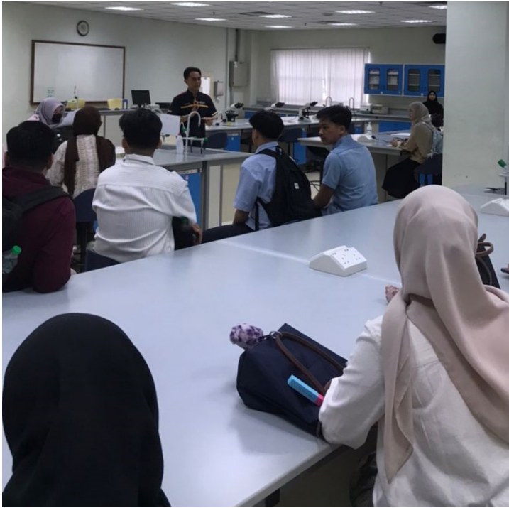
UNIVRAB students visiting teaching and practical facilities during the Academic Building tour at the Faculty of Medicine, UiTM.