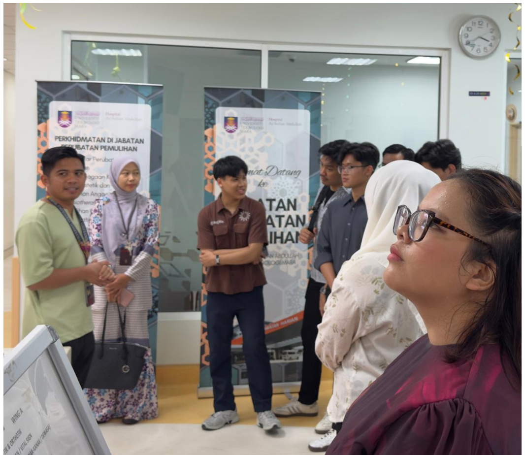
UNIVRAB students during a hospital tour at Hospital Al-Sultan Abdullah (HASA), gaining exposure to the clinical environment and healthcare facilities.