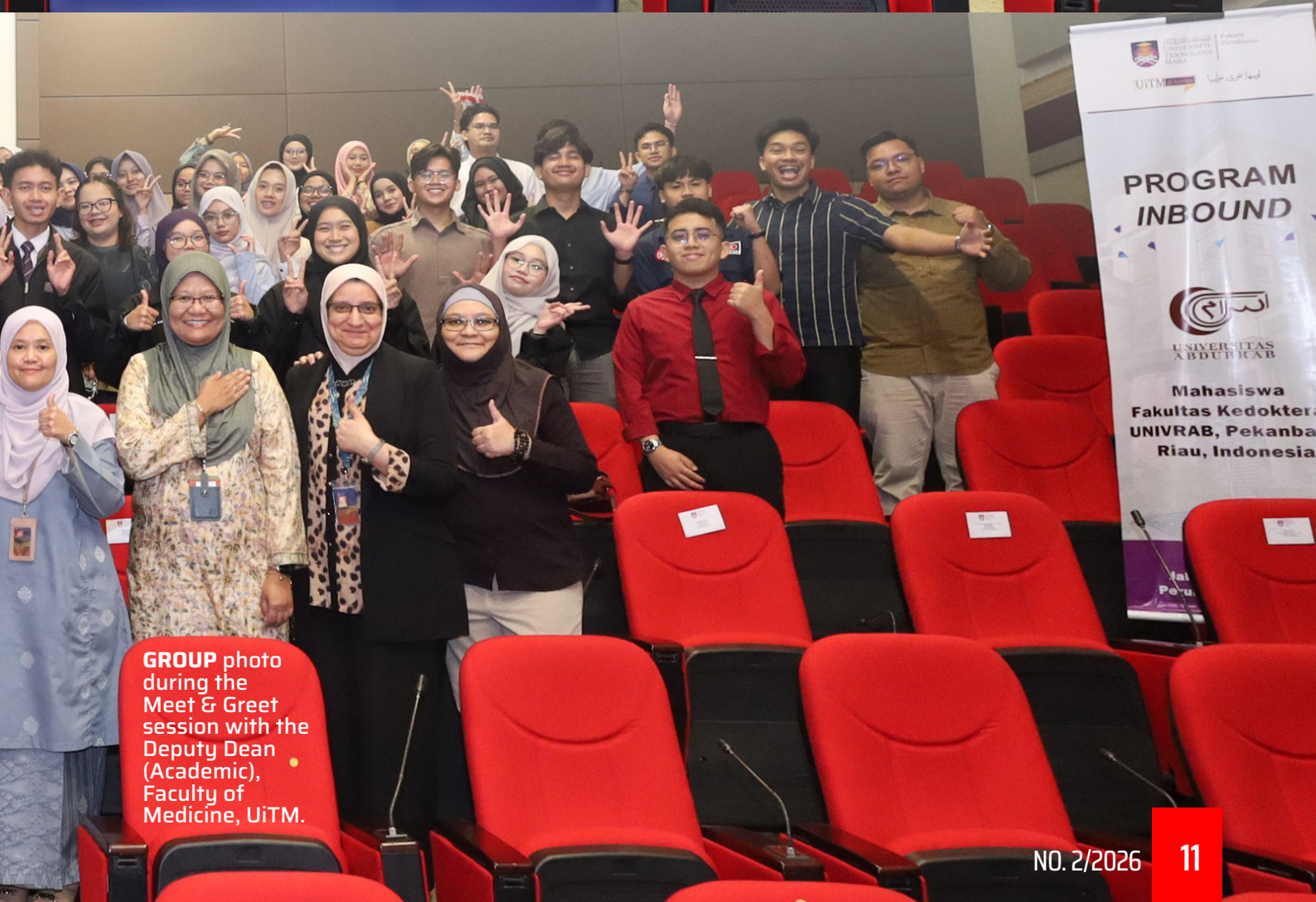
GROUP photo during the Meet & Greet session with the Deputy Dean (Academic), Faculty of Medicine, UiTM.