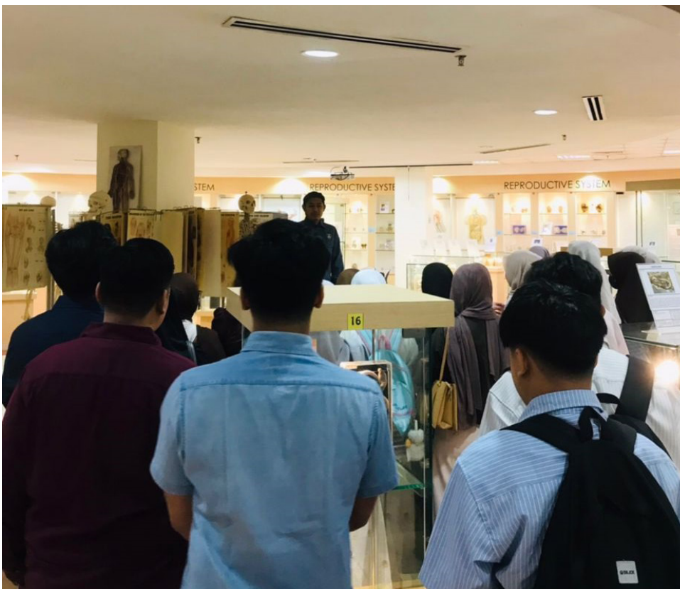
UNIVRAB students exploring academic facilities during the Faculty of Medicine building tour.

The buddy system was introduced, where each of the 25 UNIVRAB students was paired with a Year 2 UiTM medical student. This arrangement supported adaptation