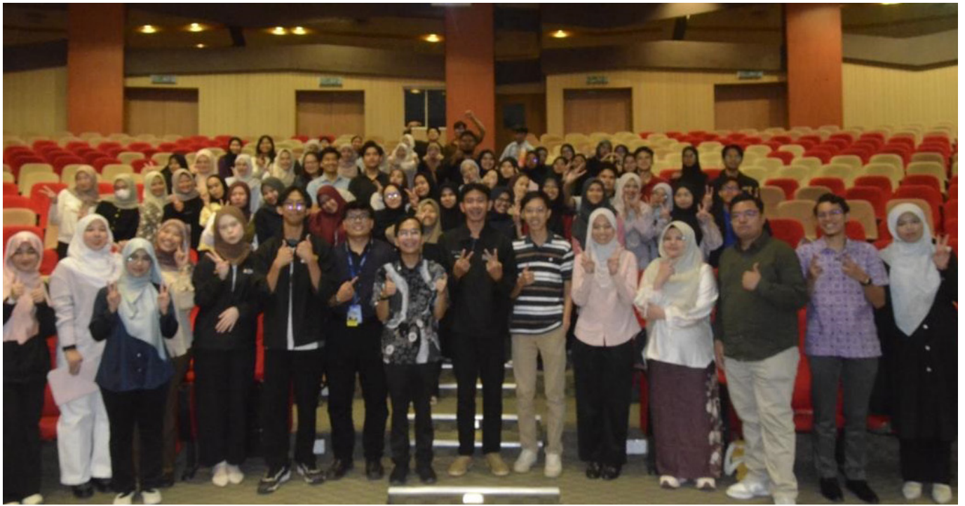
GROUP photo after the UiTM-UNIVRAB student sharing session.