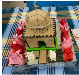
Figure 2. Prototype result