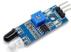
Figure 1. Ultrasonic sensor

Intelligent blind shoes provide features that help visually impaired people arrive safely at their desired destination. First of all, the special feature that differentiates between casual and sports shoes is the ultrasonic sensor, as shown in Figure 1, located at the toe cap, central, and behind the collar padding embedded inside the shoes. This sensor has the same function to detect ground-level obstacles of different heights as well as ground pits and holes. This sensor works by sending out a sound wave at a frequency above the range of human hearing and using a transducer to send and receive ultrasonic pulses that relay information about an object's proximity (What is a Buzzer, n.d).