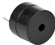
Figure 2. Buzzer 12 V

In addition, the sensors are connected to a buzzer 12 V as shown in Figure 2. The main function of it is to convert the signal from audio to sound (Aminah B.M.K, 2012). It has high sound output, good power efficiency, and a rapid response to the object detected by the sensors. As a result, visually impaired people can avoid colliding with any obstacles that could be dangerous to them.