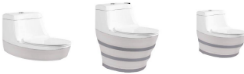
Figure 1. Toilet innovation.