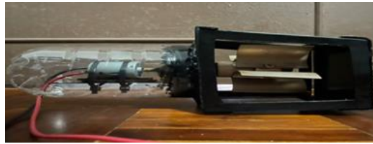
Figure 2. Side view of Compact Hydro Vertical axis Blade Turbine