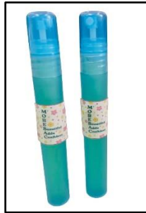
Figure 2. MOREBAC