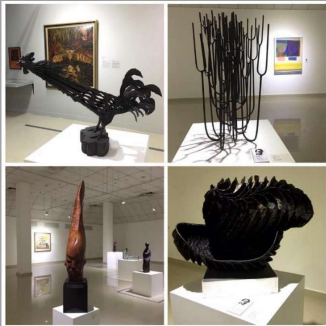
Figure 1: Four sculptures by Anthony Lau in the collection of National Visual Arts Gallery Malaysia

normazianahassan@uitm.edu.my & juaini@uitm.edu.my