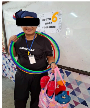
Figure 5. The son with ASD was helping his mother at an English Bootcamp (a safe environment) (2024)

The practical use of his communication skills was evident during an English Bootcamp, where he gained the experience a transition from the role of student to that of leader, acting as a facilitator and referee (see Figure 5). This setting provided opportunities to practice social pragmatics, the ability to adapt language to the social context and the relationships between speakers. He used the honorifics and the age-based registers, which are critical elements of pragmatic competence in Malaysian social interaction, by addressing participants as Adik-Adik (Younger Siblings) while adopting the persona of an Abang (Older Brother).