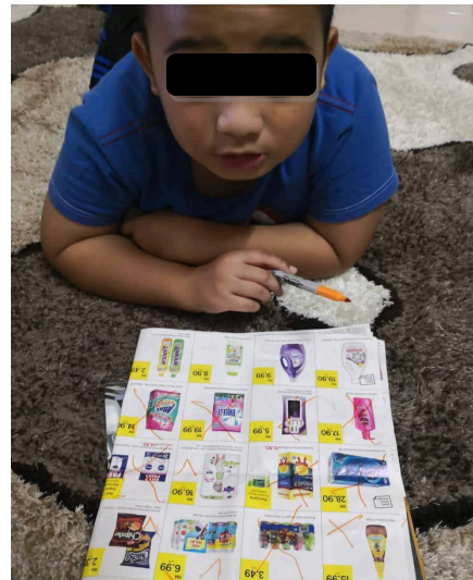
Figure 3. The son with ASD was reading and choosing items from a hypermarket catalogue before he and his mother went shopping for grocery (1 August 2018)

with a hypermarket catalogue to read, identify household items, make selections, and plan purchases.