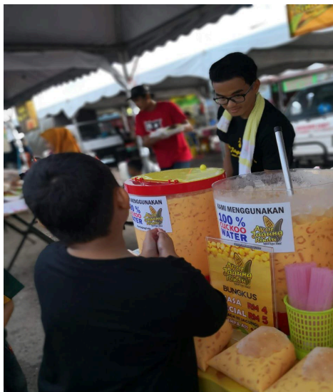
Figure 2. The son with ASD was ordering his drink at a mango juice stall (13 June 2018)

document personal emotions, challenges, and positionality as both mother and researcher. This phase established the child's baseline abilities and provided insight into the emotional and social context of communication. Figure 2 illustrates the child at a mango stall, ordering his drink while the mother guided him in making decisions and arranging his sentences.