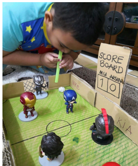
Figure 4. The son with ASD was playing a crafted football game (using straw) with his mother (12 September 2018)

Figure 4 below shows the son was blowing straw in a familiar setting and items at home. Through this activity, he learnt the simple instruction from the mother by listening and following the repeated instructions (scaffolding), variety of facial expressions and hand gestures.