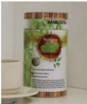
Beechayana Bambootea, Sarawak

"There could be no definition of a successful life that does not include service to others."