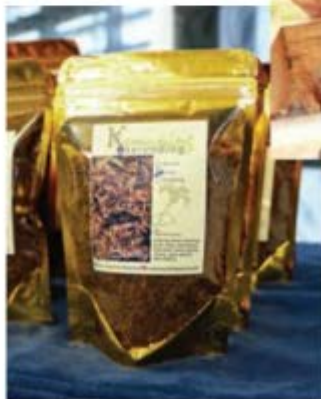
Kemuning Serunding, Kelantan