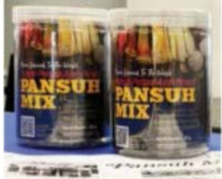
Pansuh Mix, Sarawak