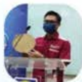
Perlis UITM Kampus Arau