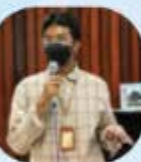
Terengganu UITM Kampus Dungun