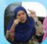
Perak UITM Kampus Sri Iskandar