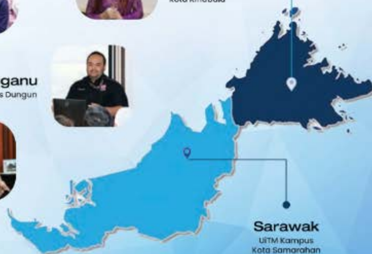
Sarawak UITM Kampus Kota Samarahan