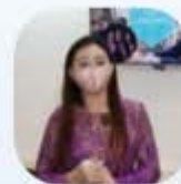
Sabah UITM Kampus Kota Kinabalu