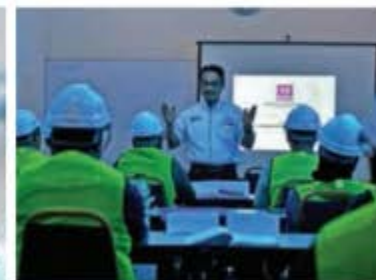
HOLISTIC SUCCESS MODULE