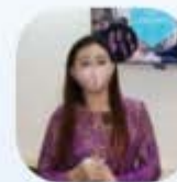
Sabah UITM Kampus Kota Kinabalu