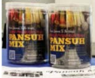
Pansuh Mix, Sarawak