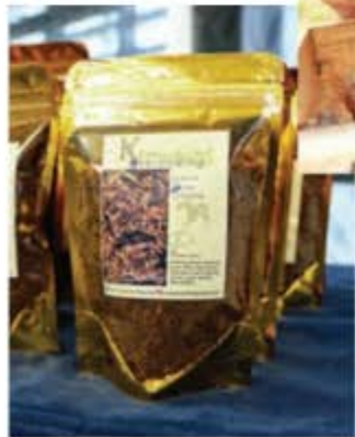
Kemuning Serunding, Kelantan