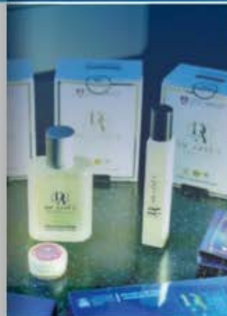
DR AZRI'S PERFUMES