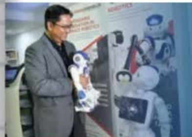
ROBOPRENUER SDN BHD

In honour of our big day, BITCOM gears up the commercialization game to an extraordinary level, where a list of Start-Up and Spin-Off companies were displayed for canvas exhibition during UiTM's grand 95th Convocation ceremony. The exhibition was presented for the attention of Kebawah Duli Yang Maha Mulia Seri Paduka Baginda Raja Permaisuri Agong and other visitors. The 9 companies canvas joined the exhibition. Therefore, we would like to thank Robopreneur Sdn. Bhd., RM Polypack (M) Sdn. Bhd., Fav Food Industries, Your Scents Enterprises, Eagle Attech Sdn. Bhd., Zakesy Biotech Sdn. Bhd., Litechium Sdn. Bhd., Nitium Technologies Sdn. Bhd., and Athanz Innovations Sdn. Bhd for their commitments.