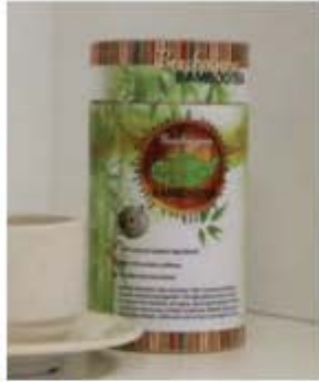
Beechayana Bambootea, Sarawak

"There could be no definition of a successful life that does not include service to others."