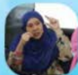
Negeri Sembilan UITM Kampus Kuala Pilah