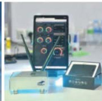
SAGA INTERNET of THINGS (IoT) GATEWAY SYSTEM