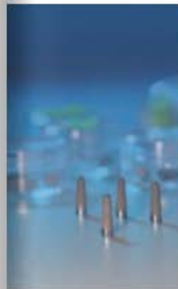
NITIUM DENTAL IMPLANT