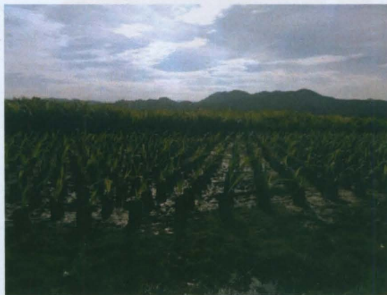
Figure 2 Example of nursery at the Sawit Kinabalu

The Sawit Kinabalu Berhad's Logo defines its corporate professionalism and commitment in galvanising growth. The prominent gold signifies strength and growth into a new era of the Sawit Kinabalu Berhad's diversified activities. Deep