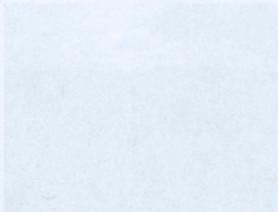
Figure 2 Example of nursery at the Sawit Kinabalu

The Sawit Kinabalu Berhad's Logo defines its corporate professionalism and commitment in galvanising growth. The prominent gold signifies strength and growth into a new era of the Sawit Kinabalu Berhad's diversified activities. Deep