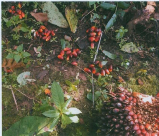
Figure 1 Example of oil palm

Sawit Kinabalu Berhad (formerly registered) was formed when the State Government of Sabah, in its continuing efforts to encourage the people of Sabah to assume a more responsible role in the growth of the State, decided to corporatise the Sabah Land Development Board (SLDB). The State Government believed that this will bring about greater efficiency and effectiveness, thereby optimising profitability and contributing directly to the economic growth of the nation.