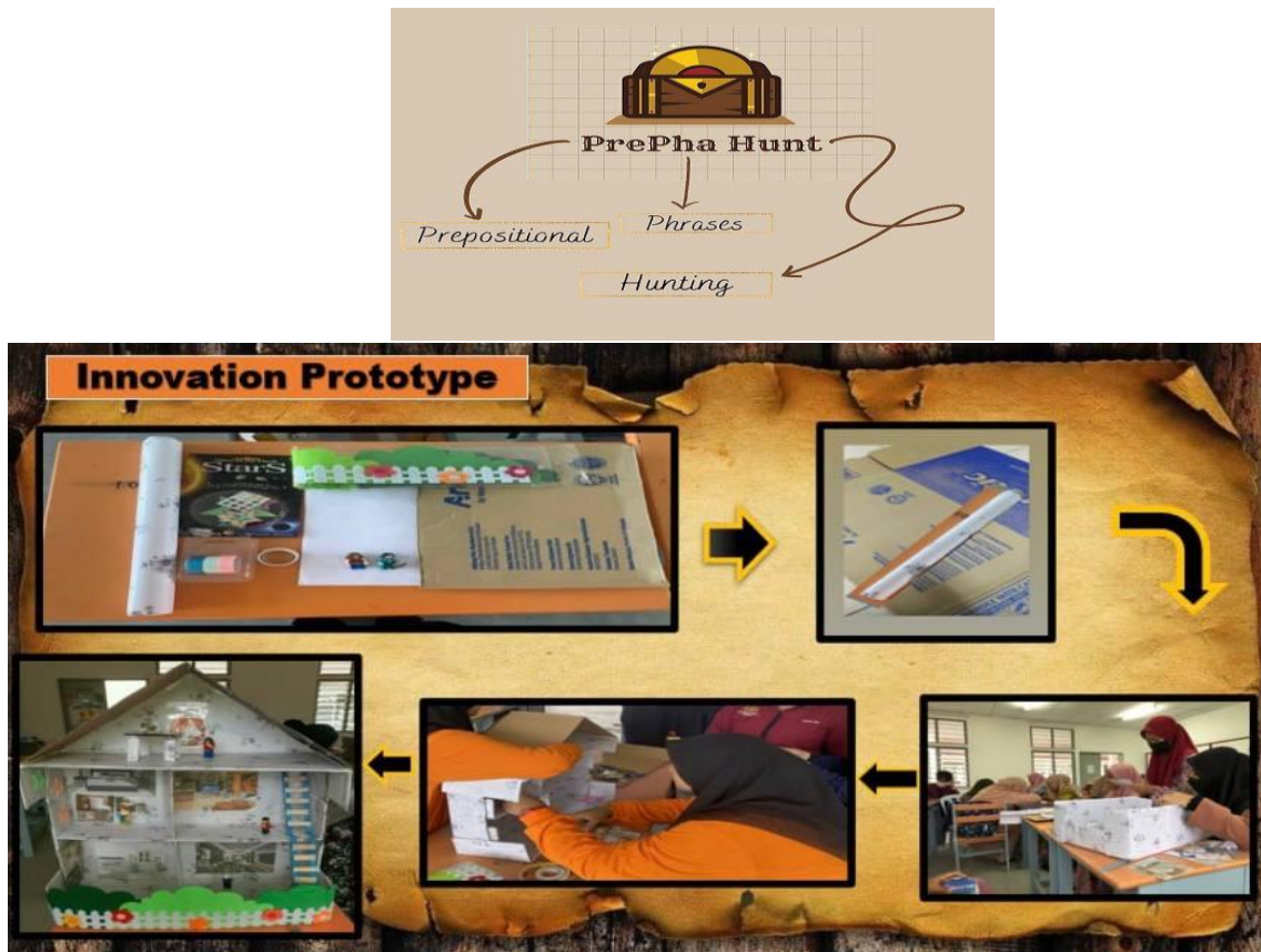
Figure 1. Innovation Prototype