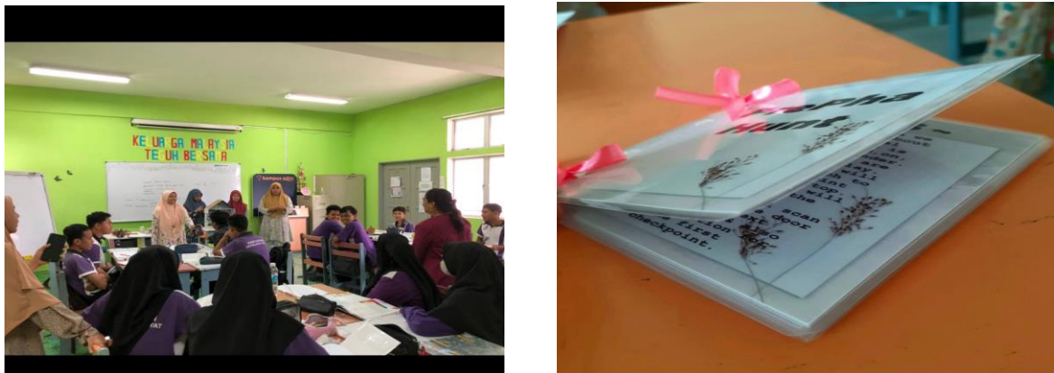
Figure 4. Sharing session and PrePha Hunt manual book

We shared our PrePha Hunt at lower form students which is Form 3 about how to play on this game and the objectives of this innovation. We also shared on YouTube about PrePha Hunt. So, the students can watch the video before they are playing this hunt game.