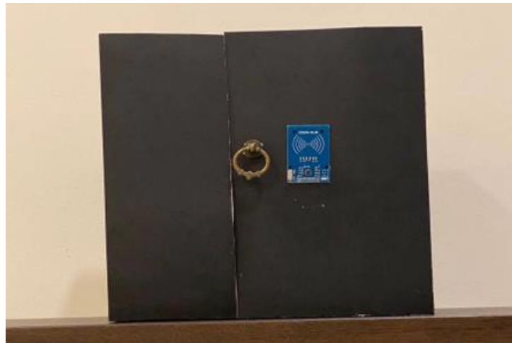
Figure 1: Front view of MyTabung

Due to uniqueness of this innovation, MyTabung is now in the middle of applying for Copyright form the authority. Once it is awarded, the innovation can be commercialized in peacefully.