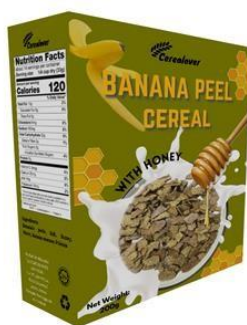
Figure 2. Packaging specification.