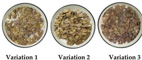
Figure 1. Types of variation.

Based on the finding, it is proven that banana peel can be used as an ingredient in many foods such as cereal product.