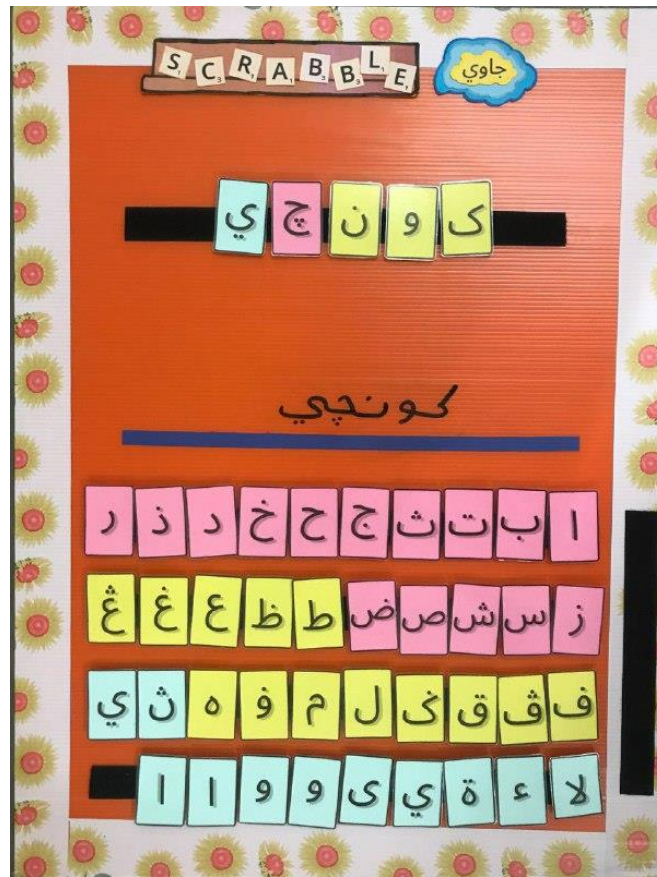
Figure 2: Jawi Scrabble example