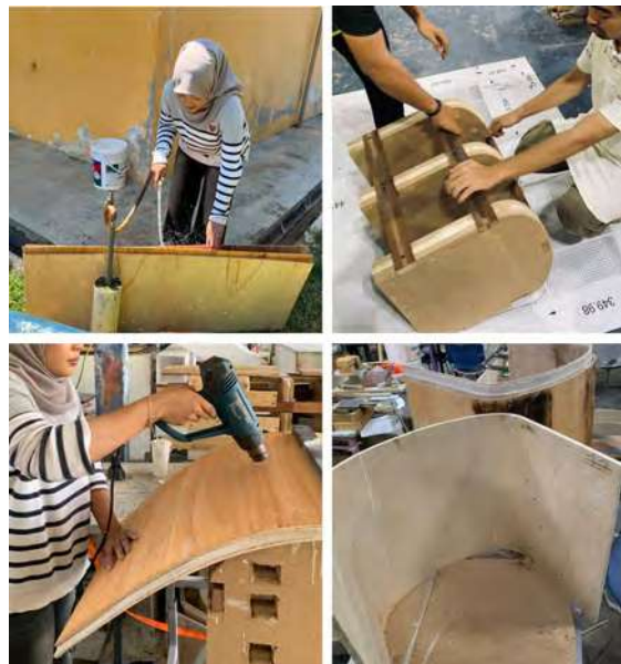
Figure 1.2 The picture of method banding

The cabinet stands on cylindrical metal rods that function as legs, offering sturdy support while elevating the design to give it a modern and light appearance. These metal rods contrast well with the organic texture of the woven Lidi Nipah, adding a contemporary touch. Additionally, the sliding door of the cabinet incorporates sulam Baba Nyonya, a traditional embroidery technique that features colorful cultural motifs. This detail serves as a tribute to heritage craftsmanship and highlights the cultural identity embedded in the design. Together, these materials plywood, Lidi Nipah, metal rods, and traditional embroidery form a harmonious composition that merges functionality with cultural significance.