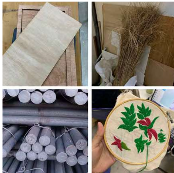
Figure 1.1 The picture material

The materials used in the construction of the Nikabinet TV Cabinet are thoughtfully selected to balance aesthetics, sustainability, and structural integrity. The main body structure is formed using 3mm and 5mm plywood, which are flexible enough to be molded into curved shapes using a specially designed mold. This plywood acts as the foundation, providing support and form to the overall cabinet.