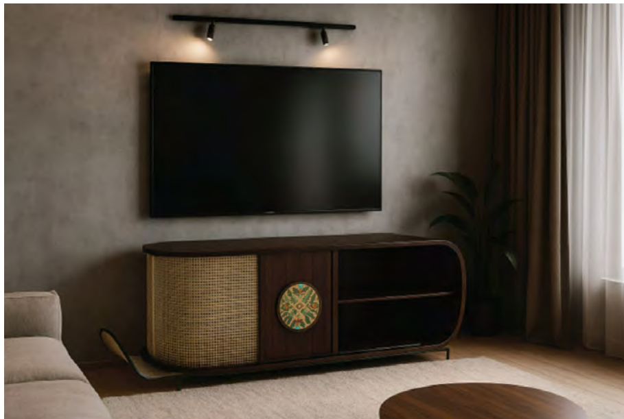
Figure 1.4 The picture of Environment (NIKABIN)

Additionally, the design integrates Baba Nyonya embroidery (sulam) on the sliding door, which adds a cultural identity to the furniture. While this element was not part of the material experiments, it complements the natural qualities of Lidi Nipah and aligns with the study's aim of promoting sustainable design enriched with traditional craftsmanship. In conclusion, the results of the flexibility experiment support the use of Lidi Nipah in creating curved and expressive furniture forms. The Nikabinet showcases how this natural material, when properly treated, can be adapted into functional, aesthetic, and culturally meaningful furniture that is both sustainable and modern.