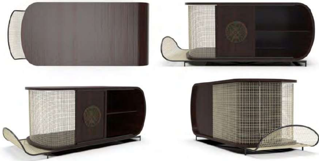
Figure 1.3 The picture of 3D final design

The application of heat must be done slowly and evenly to prevent damage or warping. The result of this banding method is a smooth, elegant, curved structure, which forms the main body of the cabinet. This technique not only enhances the visual appeal of the cabinet but also demonstrates the flexibility and formability of thin plywood when treated and shaped correctly.