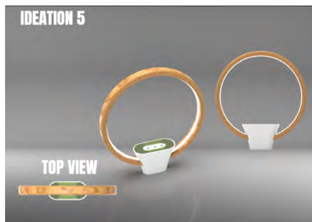
Figure 1.1 Progress of designing ideation.

The compact and balanced design ensures stability while maintaining portability deal for students with limited desk space. The circular form also allows the lamp to project even light distribution, making it functional for reading or ambient lighting. User feedback during earlier ideation stages highlighted the importance of both emotional appeal and practicality, which informed the final selection of materials and proportions in this concept. Ideation 5 embodies the core purpose of EcoAura: merging functionality, aesthetics, and wellness into one cohesive product for modern academic environments.