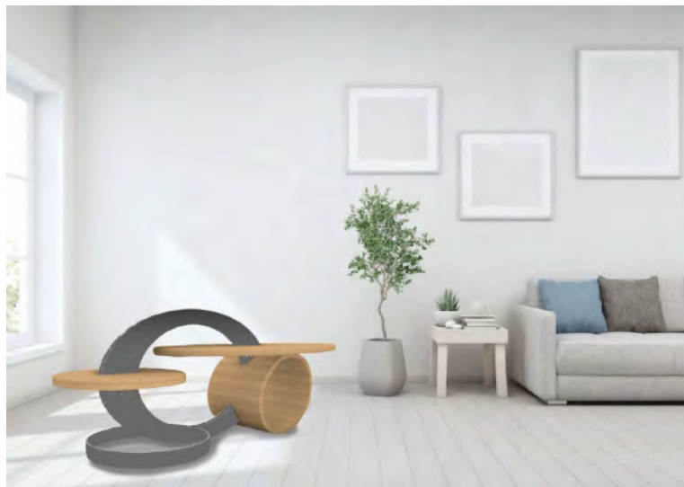
Figure 1.3: The picture of Environment (Kizuna Coffee Table)

The combination of sustainable practices, functional artistry, and cultural inspiration is embodied in the Kizuna Coffee Table. The design elevates an underutilized resource and raises environmental awareness by utilizing Nipa Palm Midrib Stick. Additional finishing methods should be investigated in future studies to improve durability and increase the range of furniture categories for which they can be used. To increase engagement and emotional resonance in sustainable furniture projects, more research into user-centered design methodologies is advised.