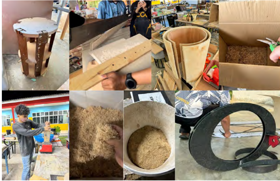
Figure 1.2: The process of making Body and Tabletop Structure

Firstly, to make the rounded shape leg, I produce a mold the same exact shape of rounded leg. I am using 3mm thickness of plywood to bend above the mold. For tabletops, I am using Nipa Palm Midrib Stick. Cut the Nipa Palm Midrib Stick into pieces to make it easy to blend. After blending, it produces fined and medium fined type of Nipa Palm Midrib Stick that have been shredded by the blender. For the body structure, I am using laser cut for 2 pieces of metal plate. After laser cut, I attach them with a welding machine with a 20mm gap of metal rod between each metal plate.