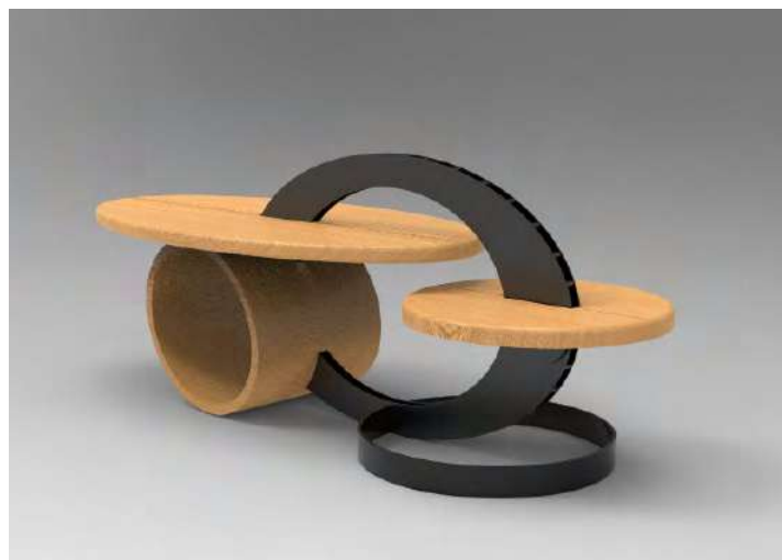
Figure 1.1: The picture of final body structure