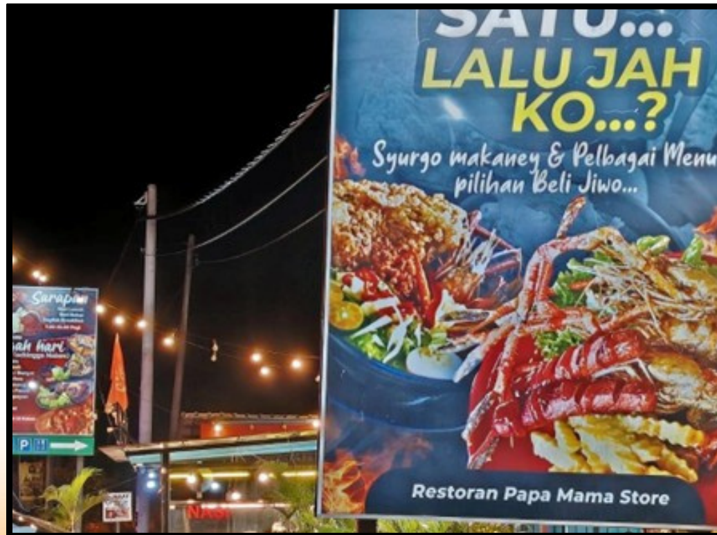
Restoran Papa Mama

No trip is complete without good food. For dinner, we visited Restoran Papa Mama Store, a popular restaurant in Jeli that is well known among locals. The restaurant was bright and lively at night, with many signboards displaying the wide variety of dishes available. The menu offers a selection of seafood and local favourites at reasonable prices. The food was delicious, and the friendly atmosphere made the dining experience even more enjoyable.