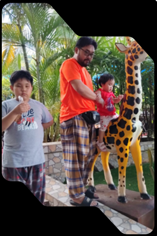
D Pergau Inn

Sometimes, a short getaway is all we need to relax and recharge. Recently, my family and I spent a short vacation in Jeli, Kelantan, a peaceful town surrounded by greenery and natural attractions. Although the trip was brief, it was filled with enjoyable moments and memorable experiences.