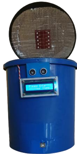
Figure 3. Assembled of Smart UV Sterilizer