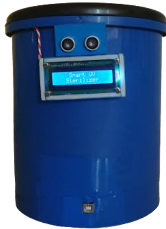
Figure 1. Smart UV Sterilizer