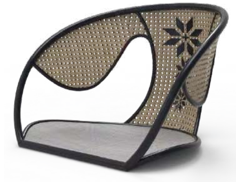
Figure 1.2 Final Design