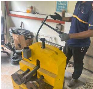
Figure 1.1 The picture of bending process

Pesaka Lapan is crafted from three key materials: metal, rattan, and fabric upholstery. The frame is constructed using metal pipes that are expertly bent to create a sleek, low profile. Metal is chosen for its strength and ability to support weight effectively. Rattan wraps around the outer parts of the chair, shaped to complement the curves of the metal frame, which lends the piece a natural, handcrafted appearance. This use of rattan also ties the design back to traditional Malay furniture. For the seat, I opted for medium-density foam covered in a woven fabric, ensuring it's comfy for sitting. The chair is designed to sit low to the ground,