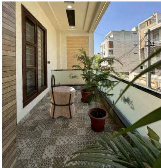
Figure 1.2 The picture of environment ( MODIG )

For future advancements, it's advisable to investigate alternative eco-friendly binders to substitute urea formaldehyde, enhance mold precision, and perform long-term strength assessments to further support its practical application in commercial furniture.