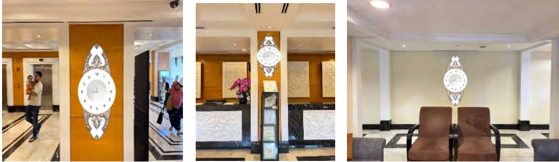
Figure 1.2 The picture of Environment (SERI MASO)