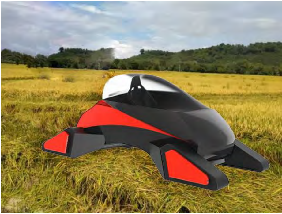
Figure 1.1 Environment of tractor