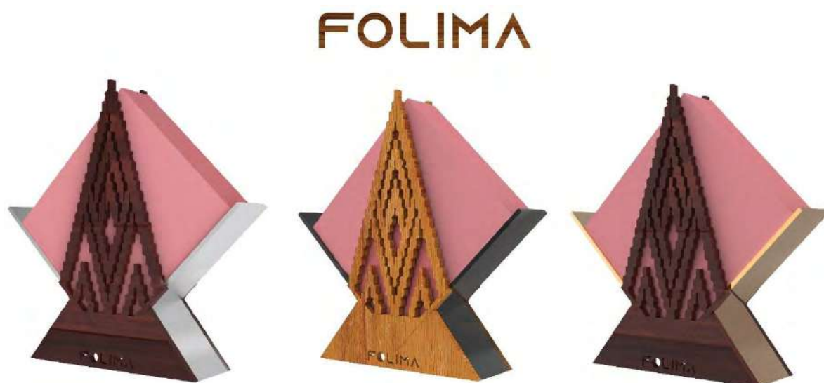
Figure 1.1 The picture of final products