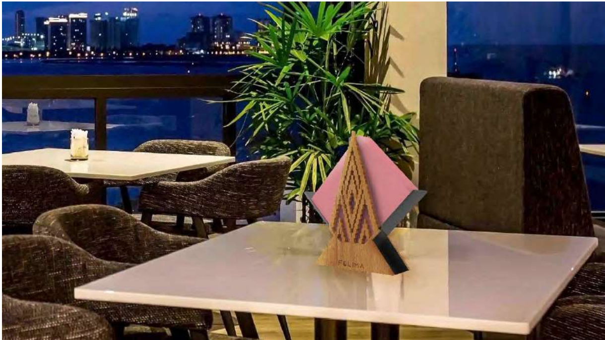
Figure 1.3 The picture of Environment (FOLIMA)