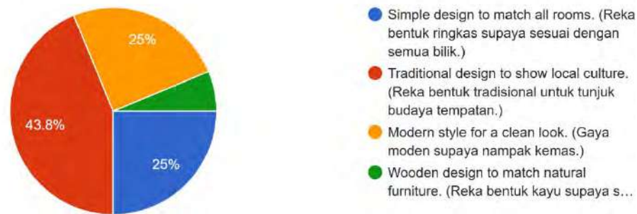
Figure 1.2 Pie Chart about design that suit to use at hotel

The survey revealed that 43.8% of respondents preferred a traditional design that reflects local culture, supporting the integration of Rumah Limas and pucuk rebung motifs in FOLIMA. Meanwhile, 25% favoured a simple design and another 25% preferred a modern style for a clean look, indicating a need for minimal yet culturally inspired aesthetics. Only 6.2% chose a wooden design, suggesting material should complement rather than dominate the visual appeal.