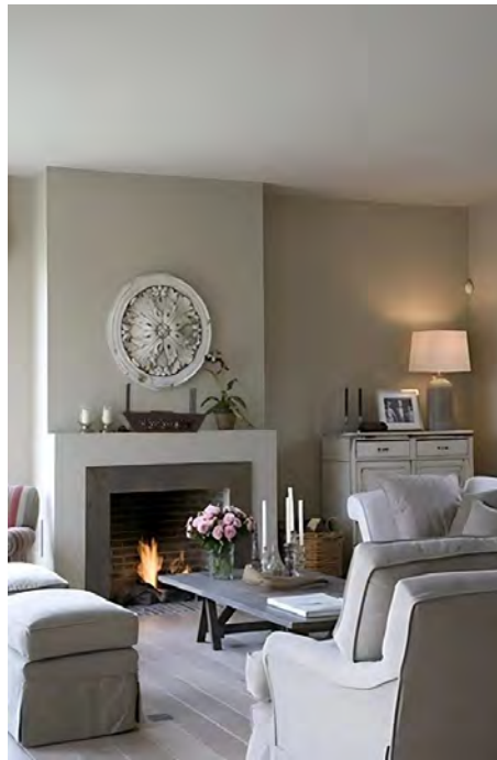
Figure 1.2 The picture of Environment (SELGUHUR)

To wrap things up, Selguhur beautifully merges culture with modern design, creating a product that's both simple and meaningful. It infuses a touch of tradition into our daily lives while showcasing the unique identity of Selangor. The design illustrates how we can keep our cultural heritage alive through innovative creativity. Looking ahead, there's plenty of room for improvement—like experimenting with different materials, crafting new versions for other states, and enhancing the packaging and overall experience. With the backing of FabCafe KL, Selguhur is poised to flourish as a cultural and contemporary home product that narrates the story of Selangor.