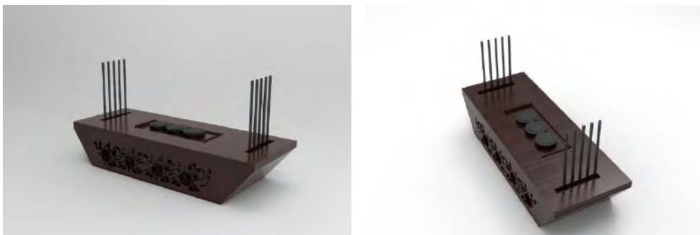
Figure 1.1 The picture of final product